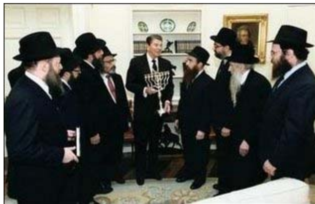
President Ronald Reagan (1981-1989)